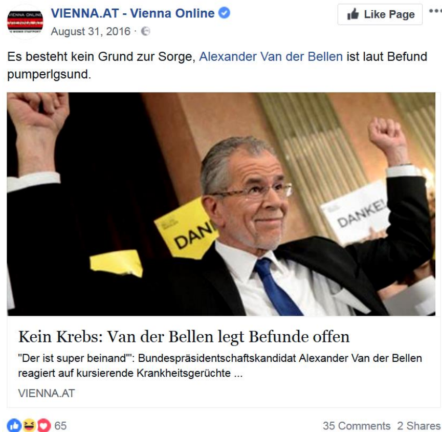
Figure 4 Disclosure of the fake news on van der Bellen’s health on Vienna.at’s Facebook page.

(and later elected president) Alexander van der Bellen was called a cancer patient as well as demented and therefore unable to become president. Shortly afterwards, van der Bellen presented a bill of health by his doctor testifying that he is healthy (Figure 4). At this point our analysis starts. The case studies come from different continents; case no. 1 from the U.S., and case no. 2 from Austria. With these two cases, we are able to find cognitive patterns and to understand information behavior at two stages of the process of deception: on the one hand, at the time shortly after the publication of the fake post; on the other hand, at the time when the fake is disclosed. We translated all Austrian comments into English; however, for some propositions we additionally present the original version in Austrian German to show the terminological atticism.