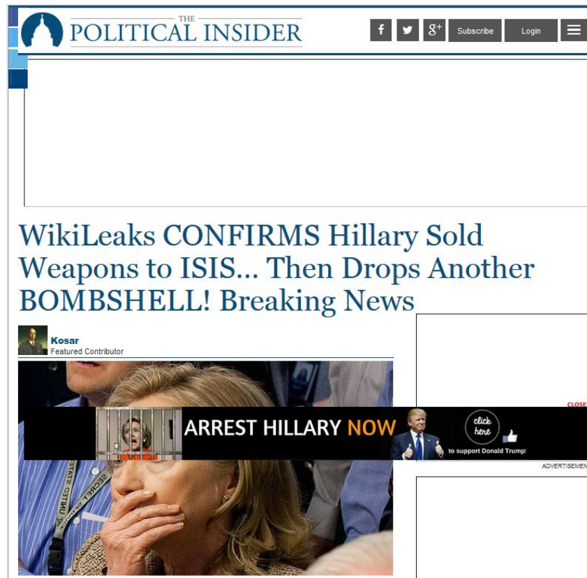
Figure 3 Triggering fake article about Hillary Clinton and her relations to the “Islamic State” on “The Political Insider.”

ly, the users play the leading roles concerning construction and maintenance of echo chambers of (fake) news.