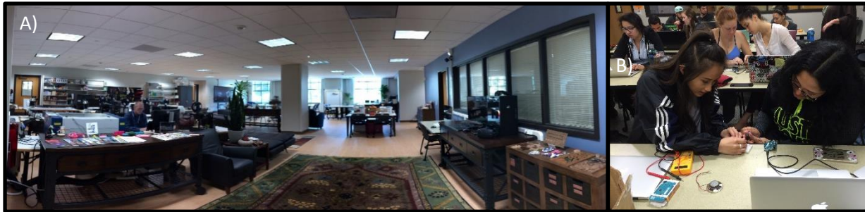
Figure 1. Making at SSU A) SSU Makerspace B) Students engaged in course DMI .

With major funding from the National Science Foundation, faculty at Sonoma State University (SSU) have been exploring teaching techniques and curricular designs to optimize student learning, as well as attract students to STEM fields through the use of a campus makerspace. While makerspaces are becoming prevalent across K-16 campuses nationwide, maker pedagogy and research has been primarily focused on K-12 educational environments. SSU has successfully implemented a signature two thousand square foot makerspace (see figure 1), a course in making, Science 220: Dream, Make, and Innovate (DMI) , and assessment of the program. Maker pedagogy and curriculum looks very different across K-16 institutions. As opposed to K-12 education, university level maker efforts tend to be supported with significantly greater technical infrastructure, integrated with teaching science and technology, and limited to a smaller number of users. Regardless of education level, all maker programs emphasize interdisciplinary and experiential learning, and support an artistic approach to technology. In these educational environments STEAM truly flourishes. For current students, who identify as digital natives, makerspaces provide a bridge back to hands-on, real world experiences.