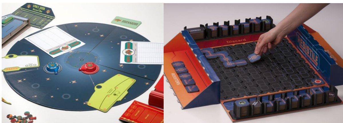
Figure 5. Final prototype lab kits

With new knowledge in hand the designers iterated on their concepts and tested again. This process is repeated with refinements occurring each time until a solution is reached (see Figure 5) that serves all of the learning objectives set out by the Physics faculty and is fun enough to keep students coming back for more.