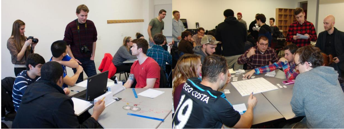
Figure 2. Design students observe and record gameplay of early lab kit prototypes

While this type of research is imperative to the success of any design project observation alone is not enough to fully understand a problem. As such, ID students performed the labs first hand stepping far outside their comfort zone learning how to calculate vectors and resistance across a circuit. From all of these activities the students gleaned numerous insights around gameplay mechanics, physical components, team dynamics and perhaps most importantly, which elements were fun. These provided opportunities that could be leveraged in the next phases of the design process - ideation and prototyping. The students then developed concepts, first in 2D and then through physical 3D models (Figure 3). How the kits will be stored and deployed in a classroom, how many pieces they might include and how easy the rules are to understand were just some of the concerns at front of mind.