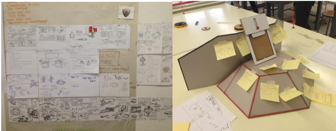
Figure 3. Examples of 2D and 3D design development for Sector Vector

While this type of research is imperative to the success of any design project observation alone is not enough to fully understand a problem. As such, ID students performed the labs first hand stepping far outside their comfort zone learning how to calculate vectors and resistance across a circuit. From all of these activities the students gleaned numerous insights around gameplay mechanics, physical components, team dynamics and perhaps most importantly, which elements were fun. These provided opportunities that could be leveraged in the next phases of the design process - ideation and prototyping. The students then developed concepts, first in 2D and then through physical 3D models (Figure 3). How the kits will be stored and deployed in a classroom, how many pieces they might include and how easy the rules are to understand were just some of the concerns at front of mind.