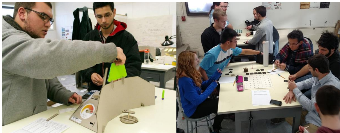
Figure 4. Physics students test out prototypes for Sector Vector (left) and Resistile (right)

With new knowledge in hand the designers iterated on their concepts and tested again. This process is repeated with refinements occurring each time until a solution is reached (see Figure 5) that serves all of the learning objectives set out by the Physics faculty and is fun enough to keep students coming back for more.