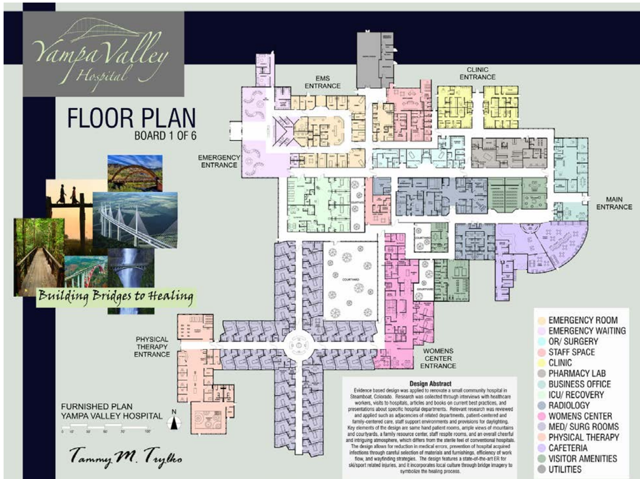
Figure 1: Senior students enrolled in the capstone course prepared renovated space plans for a hospital built in 1987. The student identified a uniquely defining concept from regional geography and demographic aspects in order to inform the design response. Illustration by student. (Figure 1 Floor Plan.jpg)