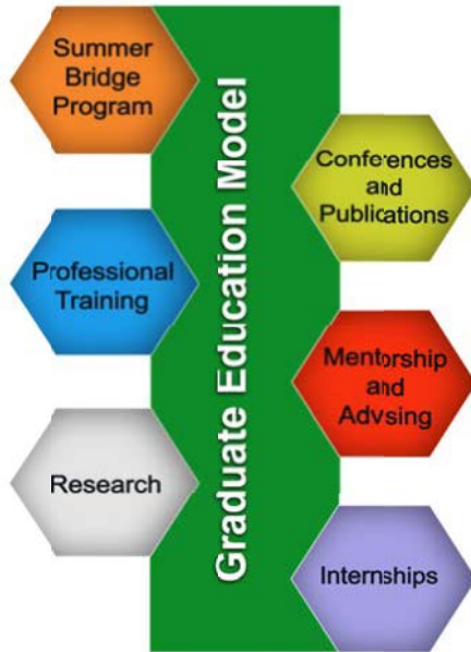
Figure 2 The elements of the graduate model include: