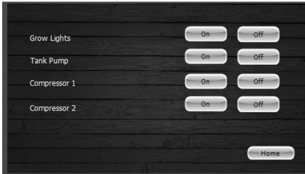
Figure 4: Hardware Screen

This screen allows manual adjustment the external hardware, shown in Figure 4.