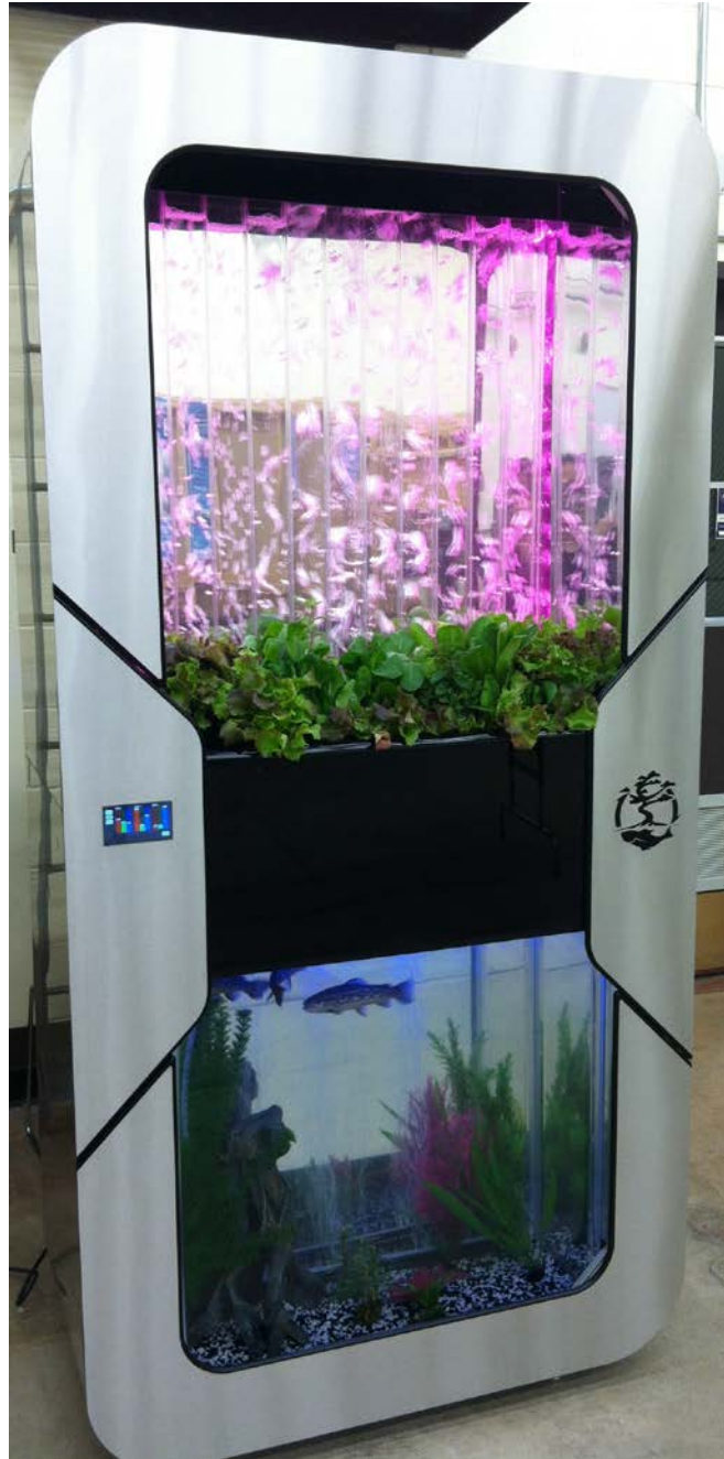
Figure 5: Completed Aqua-Life System