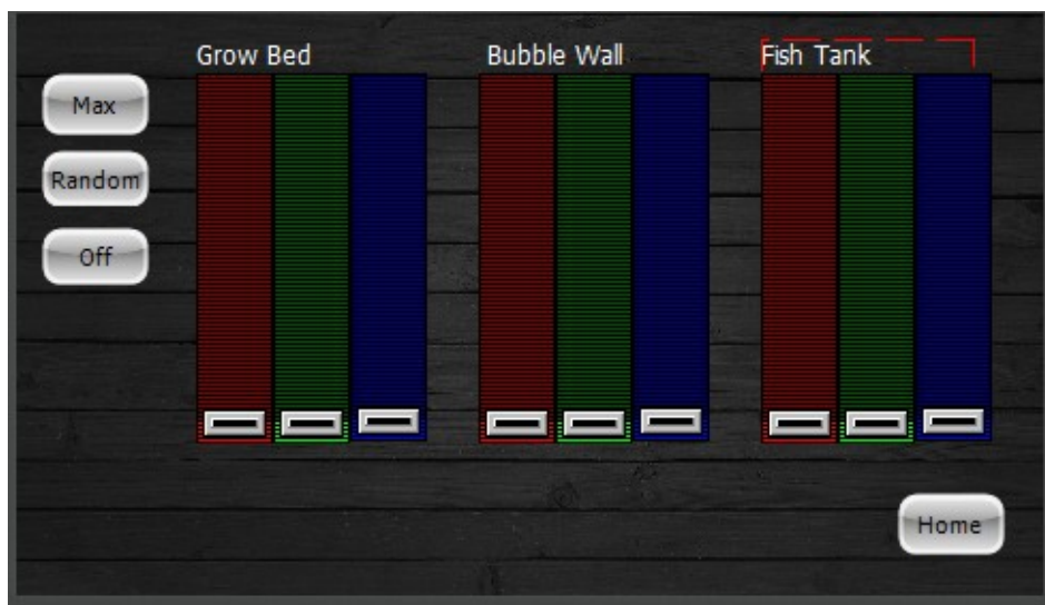
Figure 3: LED Lights Screen

Touching the Led Lights button on the home screen can navigate the LED Lights. This screen allows adjusting of the RGB Led lights by sliding the associated slider for the different zones. The Max button turns all RGB zones to white light or red=255 green=255 and blue=255. The random button selects random values for all RGB zones to change colors as shown on Figure 3. The Off button turns all RGB zones off.