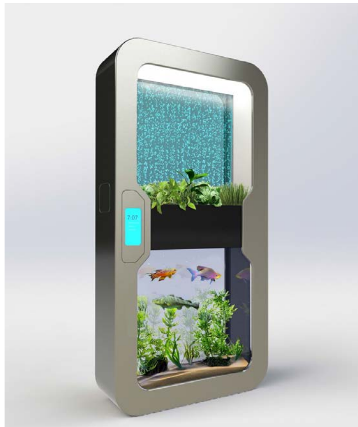
Figure 1. Aqua-Life

Each member of the team came up with a few ideas and designs for this project. They went through the brainstorming sessions and chose a few preliminary designs. The Aqua-Life, Figure 1, shows the rendering of the final preliminary design that was chosen by the client.